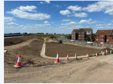
Reinstatement Fisherman's Corner compound