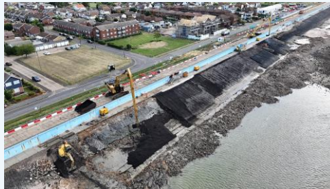
LSA/OSA placement at Eastern Esplanade