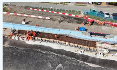
Chapman Sands ramp reinforcement being installed