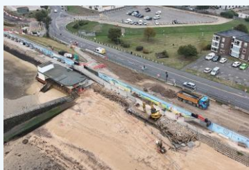
Work on Concord Café phase