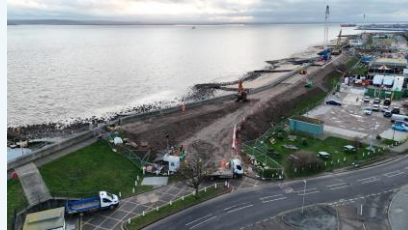
May Avenue Pumping Station Temporary Access Ramp