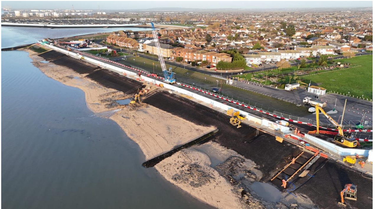
Works on the revetment at Thorney Bay and Labworth Cafe