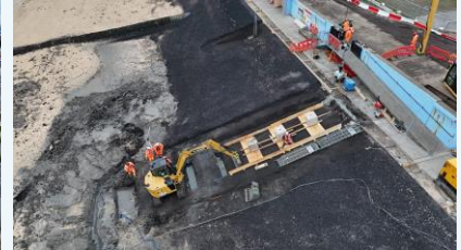
Steps installation at Labworth Cafe