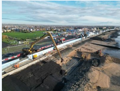
Laying OSA/LSA near The Labworth